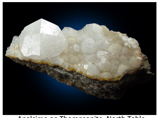
Analcime on Thompsonite, North Table Mountain, near Golden, CO

Geology : During early Paleocene time shoshonite porphyry lava was extruded from several plugs about 5 km north of Golden, Colorado to form lava flows intercalated in the upper part of the Denver Formation. These flows have been dated as being between 63 and 64 million years old; a total of four distinct flows were erupted non-explosively over about one million years; subsequent erosion of the flows and interbedded sedimentary rock has resulted in the formation of North and South Table Mountains.