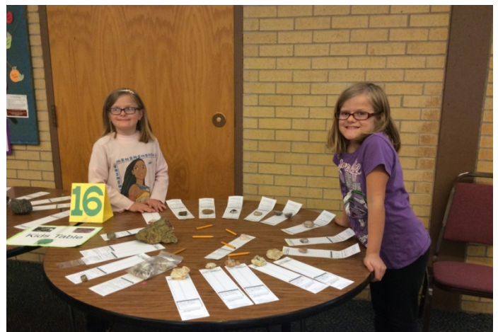
Kids only tables with lots of great specimens to bid on.