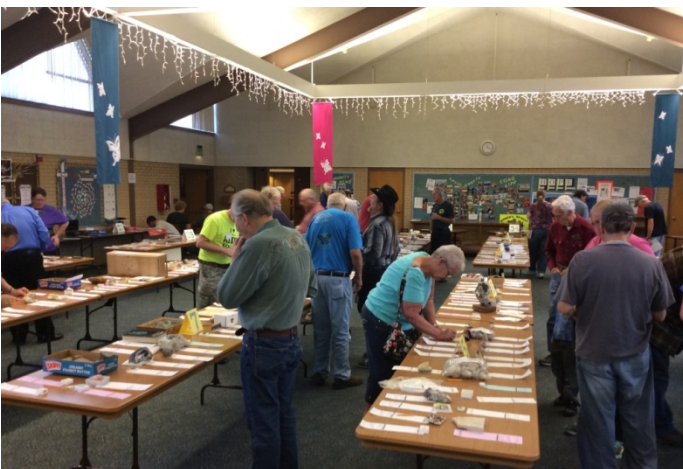
CMS May silent auction tables with bidders mingling about.