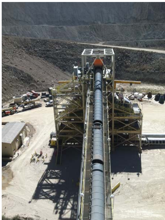
View of second stage crushing tower. Note that gray material behind the plan on the pit walls is milled ore that is being leached with cyanide solution to extract the gold.