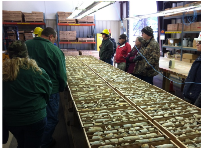
CMS members inspecting boxes of drill core. Core samples are assayed to determine gold content of the rock so operators know whether or not to process rock produced by the open pit operation.