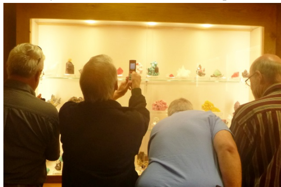
CMSers view "Colorado Treasures" in the Vault