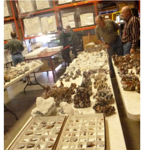
At the CE wholesale warehouse