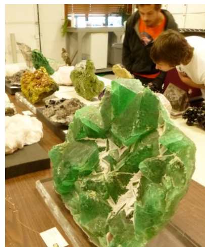
Checking out the specimens in the Prep Lab