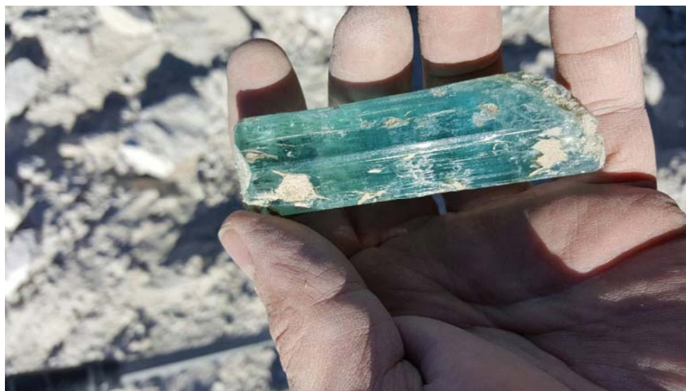
Figure 3. The second day's aquamarine find on the south knob of Mount Antero. The crystal is 1.2 x 3.94 inches and 450 carats.