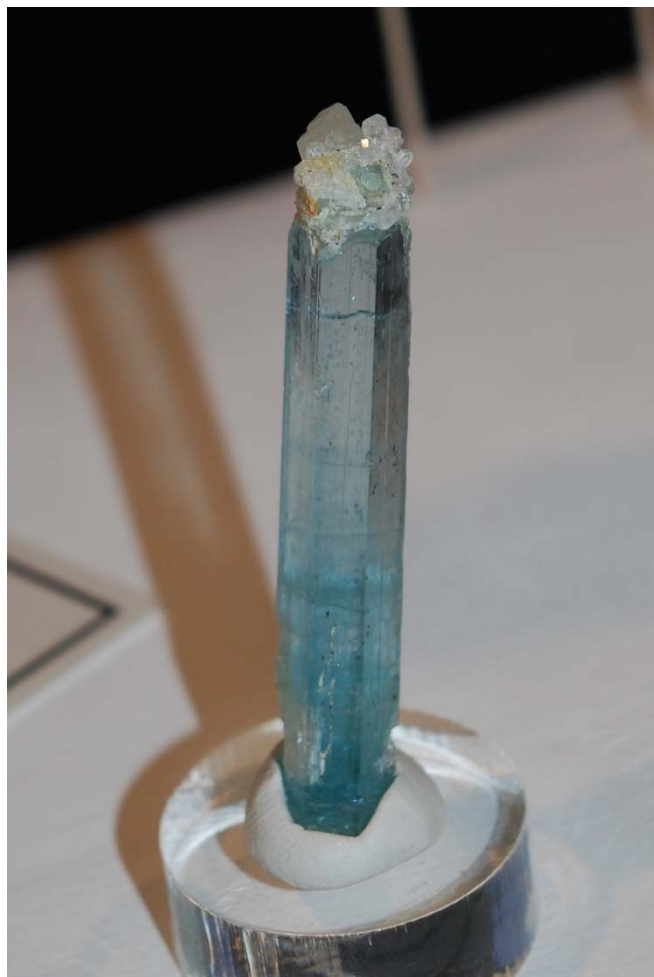
Figure 1. The thin aquamarine found on Saturday, on the north face of the south knob of Mount Antero. Displayed at the September Denver Gem and Mineral show. The specimen is 0.50 x 2.45 inches and 55 carats.

Chris says "I think I'll try the same thing." No sooner was it said than he noticed a little tip of white on blue something sticking out from the gray-colored crushed granite debris next to him. It almost looked like trash. He went over to the spot to inspect; the white was phenakite stuck on the top of some blue aquamarine. He started pulling it out of the ground and it just kept coming. About 3.5 inches of aquamarine came out. He was stunned; it was amazing. Ray let out a big yelp of excitement.