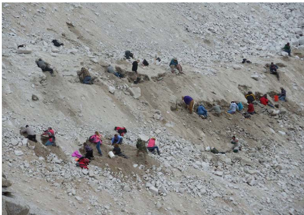
Figure 2. View of the club digging on the north face of the south knob of Mt. Antero.