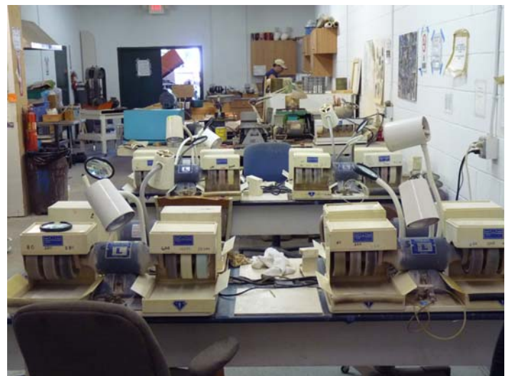
RAGMS Lapidary workroom at the museum