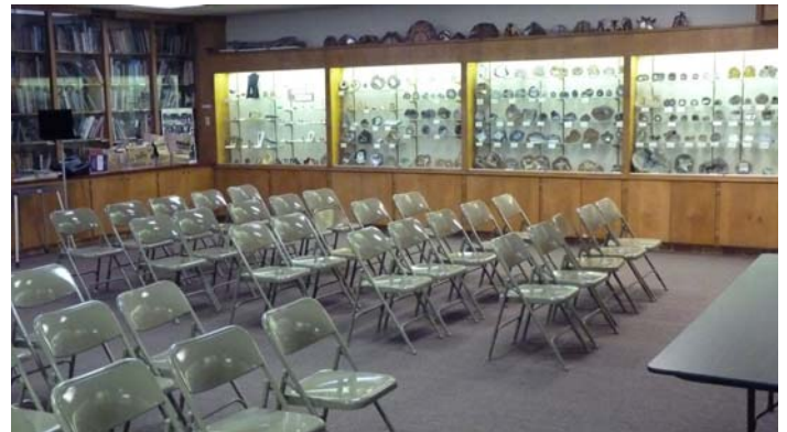
RAGMS meeting room with agates on display

While in the area, we also took advantage of the beautiful fall weather and visited Crater Lake National Park and Oregon Caves National Monument. Both of those are within an hour and a half drive of Medford, and are of particular interest to those of us with a geological bent to their nature.