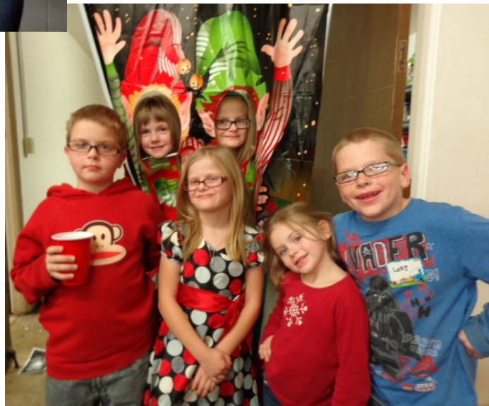
CMS Junior Rockhounds having fun!