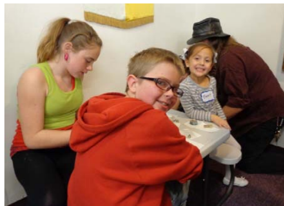
Kid's mineral challenge