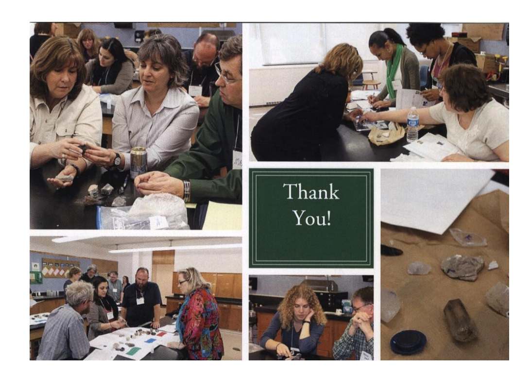
Photo showing recent GSA Teacher Advocate Program workshop on mineral properties held in Boulder, Colorado featuring mineral specimens donated by CMS members.