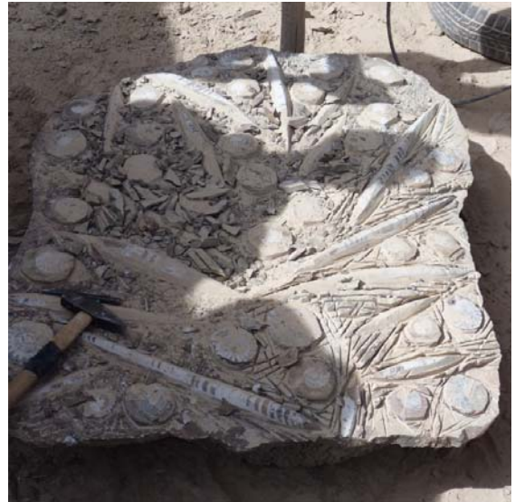
A large plate of orthoceras and goniatites ammonites being prepared in Erfoud.