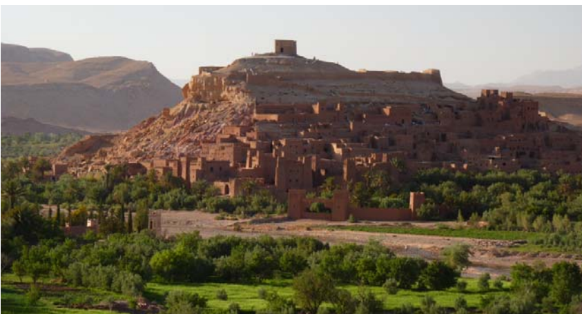
Kasbah Ait Ben Hadou, seen in movies such as Gladiator and Jewel of the Nile.