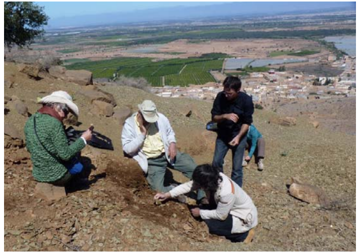
Digging for trilobites near Tazemourt, southwest Morocco.

quarries where the many orthoceras and goniatites ammonites are collected and prepared, and visited factories that prepared sinks, plates, bookends, and many other items made from these fossils. We also visited factories where trilobites are both fabricated and prepped. Not all Moroccan trilobites are “faked” – we observed the very careful and precise preparation of some of those intricate spiked trilobites that you see on the market. We bought a few flats of the more common trilobite species, but also bought a couple of the more delicate ones for ourselves. Minerals that we purchased included erythrite, vanadinite, barite, siderite and quartz, epidote and quartz, cobaltoan calcite, and “hourglass” amethyst. Unfortunately, we had to leave behind some beautiful azurite, as well as other higher-end specimens and meteorites.