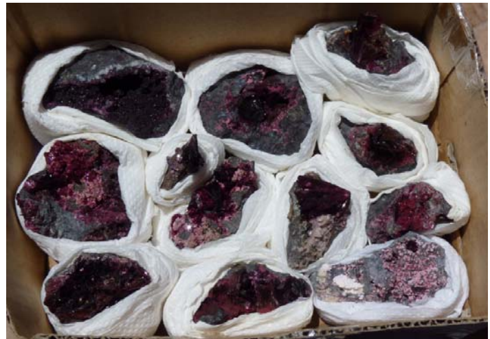
A flat of erythrite and roselite from the Bou Azer mining district, southern Morocco.