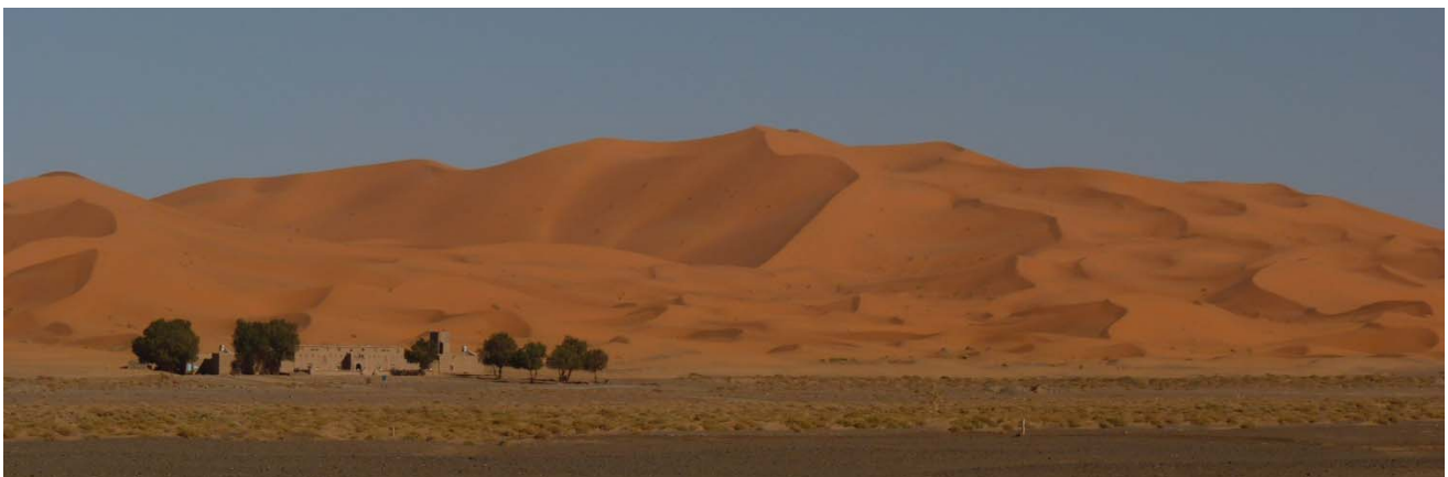
Giant sand dunes near Merzouga, southeast Morocco.