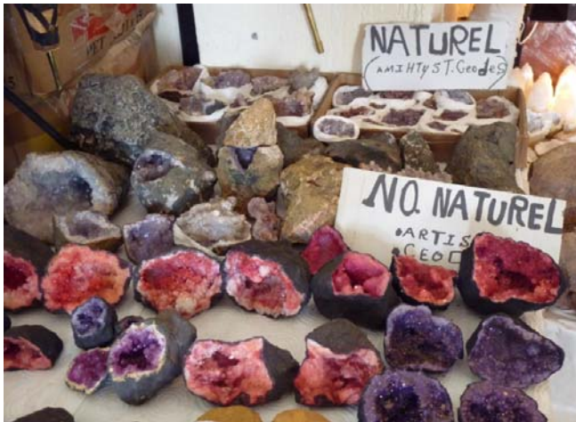
Finally, a shop that has specimens properly labeled.