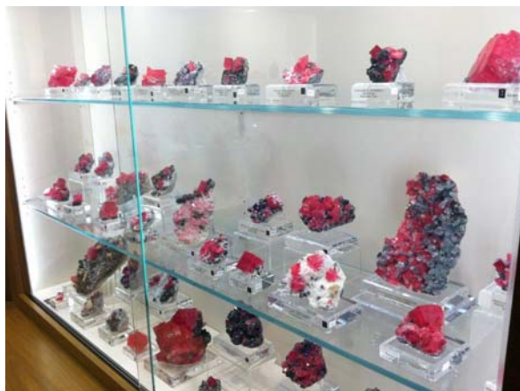
Case of Sweet Home rhodochrosite specimens in the "Vault" at Collectors Edge. Wow!

The CE trip marks the end of what I hope everyone thought was a pretty successful 2014 field trip season. We visited several new sites and a number of old standbys. Several trips were joint trips with the Flatirons Mineral Club (FMC). There were a number of outstanding finds as evidence by two full cases of excellent specimens displayed at our Founder's Day picnic in early September and our 1 st place award in the Club Prospector's Competition at the Denver Show (see last month's CMS newsletter for photos). A review of the 2014 season follows.