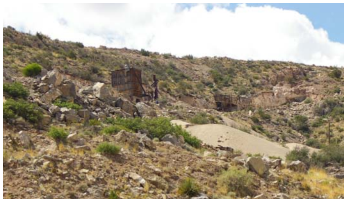
View of the Portalis Mine adit, just below the Blanchard Mine proper.