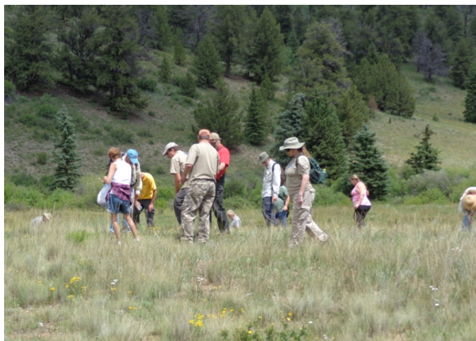
Salt Creek Jasper Field collecting area.