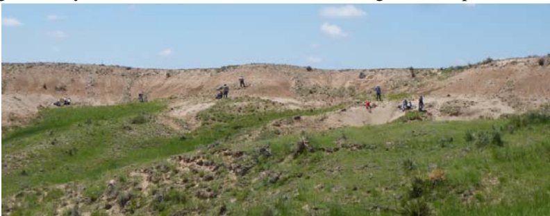
CMS members collecting at the Stoneham Barite locality in Weld County, CO.

On May 31st, we were able to visit the Stoneham barite locality. This site had been off limits to club visits for several years following efforts by the Colorado State Land Board (SLB) to restore the site for grazing, following a mineral specimen mining lease that ended a couple years ago. Thirty CMS members visited the site along with a representative from the SLB who was there to ensure all SLB rules were followed. Everyone found some of the famous blue barite and a few very nice specimens were found, including ones by Bubba Hayes and Alan Cross that were selected for display in the Club Prospector's case. Based on post-trip conversations with the SLB rep, CMS members acquitted themselves well on the trip and the SLB appears receptive to us visiting the site next year.