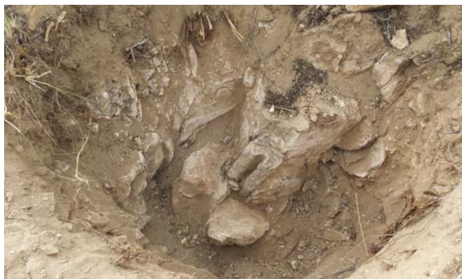
Here is the hole showing vertically oriented limb cast (center) surrounded by fossilized algae rind.