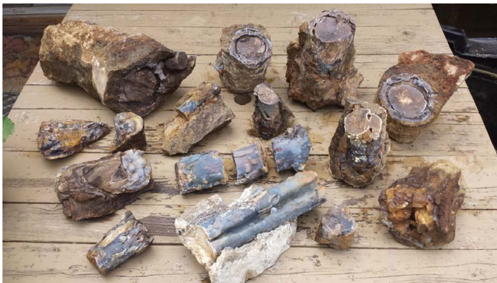
Here is the cleaned up material extracted from the hole. The limb section in matrix in the bottom center of the photo was selected for the Club Prospector's case display and is approximately 12 inches long.

On July 13th, CMS members headed up to Montezuma, Colorado (just up the road from Keystone) led by Bruce Geller. We were hosted by the Robert Martin family and the mine dumps we visited were owned by Robert's grandfather. Because the mine dumps are on private property there is a lot of material to be found including sphalerite, galena, magnetite, barite and some massive rhodochrosite. A lot of fun!