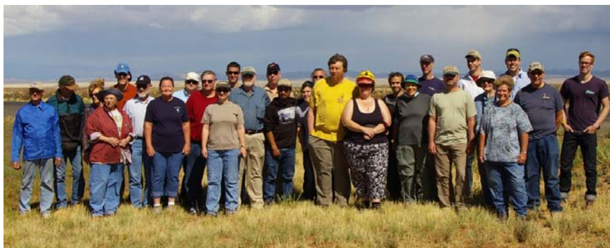
CMS members who attended the Blanchard Mine trip taken at Bingham, NM.