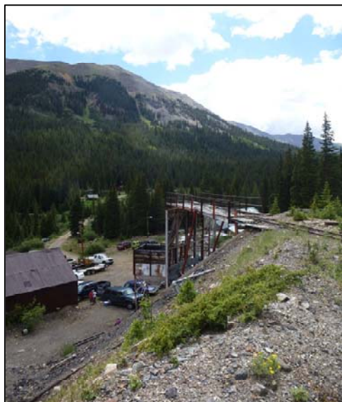
View of Martin property and old adit at upper level of silver mine at Montezuma, CO. Some excellent ore samples were found in the road bed for the narrow gauge rails used to transport ore from this adit.

On July 13th, CMS members headed up to Montezuma, Colorado (just up the road from Keystone) led by Bruce Geller. We were hosted by the Robert Martin family and the mine dumps we visited were owned by Robert's grandfather. Because the mine dumps are on private property there is a lot of material to be found including sphalerite, galena, magnetite, barite and some massive rhodochrosite. A lot of fun!