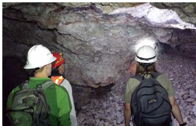
View of inside of Sunshine #3 adit. The host rock at the Blanchard Mine is a vuggy, silicified dolomite. Nearly all the vugs are filled with a mix of quartz, fluorite, galena, gypsum and secondary copper minerals such as linarite and cyanotrichite. Lots of sparkles when the headlamps are turned on!