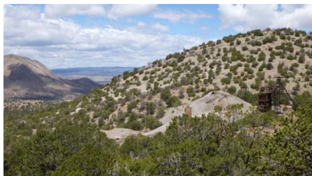
View of Kelly Mine dumps and workings including head frame of the main vertical shaft, near Magdalena, NM.

On May 31st, we were able to visit the Stoneham barite locality. This site had been off limits to club visits for several years following efforts by the Colorado State Land Board (SLB) to restore the site for grazing, following a mineral specimen mining lease that ended a couple years ago. Thirty CMS members visited the site along with a representative from the SLB who was there to ensure all SLB rules were followed. Everyone found some of the famous blue barite and a few very nice specimens were found, including ones by Bubba Hayes and Alan Cross that were selected for display in the Club Prospector's case. Based on post-trip conversations with the SLB rep, CMS members acquitted themselves well on the trip and the SLB appears receptive to us visiting the site next year.