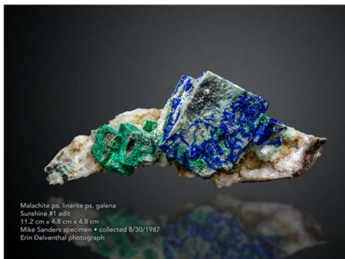
Malachite ps. linarite ps. galena Sunshine #1 adit 11.2 cm x 4.8 cm x 4.8 cm Mike Sanders specimen • collected 8/30/1987