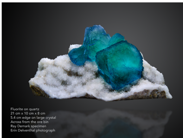
Fluorite on quartz 21 cm x 10 cm x 8 cm 5.4 cm edge on large crystal Across from the ore bin Ray DeMark specimen

The Blanchard Mine, located in the Hansonburg District in the northern portion of the Oscura Mountains, Socorro County, New Mexico, has earned its place as a classic New Mexican locality through the production of widely available, high-quality mineral specimens - most notably the “Blanchard blue” fluorite (often associated with galena) as well as the discovery of some of the world’s largest known linarite crystals. However, the rich mineralization at the Blanchard Mine produces a suite of other minerals that appeal to many varieties of collecting styles.