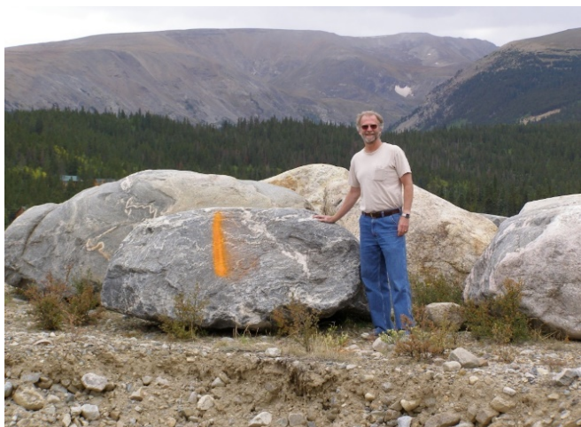
Figure 1: Candidate boulders in Fairplay, CO

The talk is about 2/3 geology and 1/3 lapidary. The geological portion is presented as biographical story that traces the journey of a 9 ton gneiss boulder found in Fairplay, CO from its birth in an ancient volcano 1.8 billion years ago to unearthing by a glacier 10-20 thousand years ago. The lapidary portion describes the steps taken to haul the boulder off to a diamond wire saw to be slabbed and made in to a residential floor.