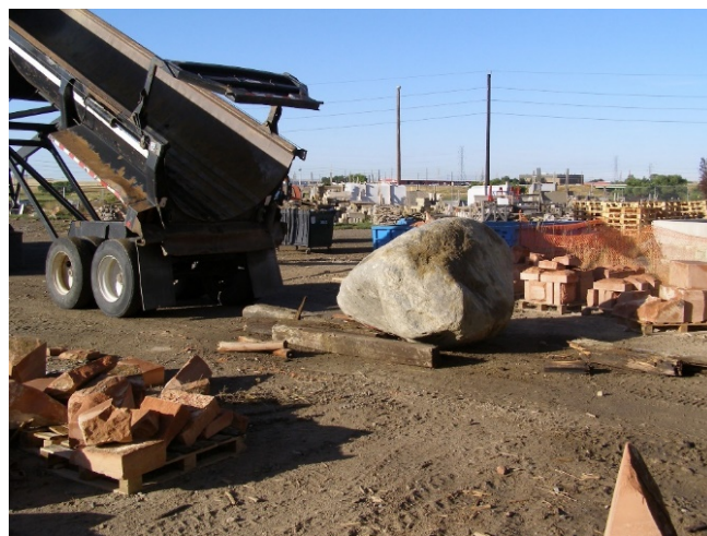
Figure 2: Unloading boulder

My background: I'm half engineer and half artist. I work as a staff research electromechanical engineer at the University of Colorado. Geology is an avocation where I use the science of geology to inform the direction and composition of the art pieces. Two large rock panels are on permanent display inside the University of Colorado Earth Sciences Building.