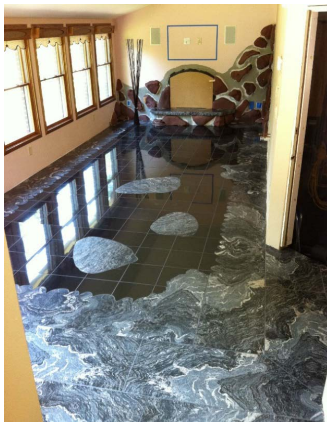
Figure 3: Finished "primordial soup" floor

My background: I'm half engineer and half artist. I work as a staff research electromechanical engineer at the University of Colorado. Geology is an avocation where I use the science of geology to inform the direction and composition of the art pieces. Two large rock panels are on permanent display inside the University of Colorado Earth Sciences Building.