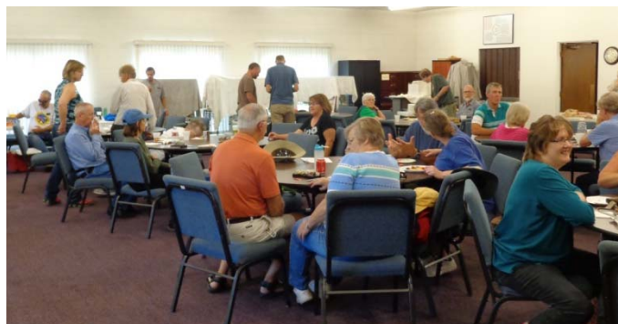
Socializing during the picnic