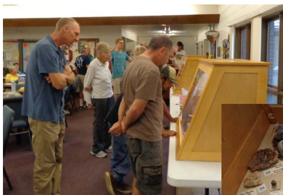
Voting for the best specimens