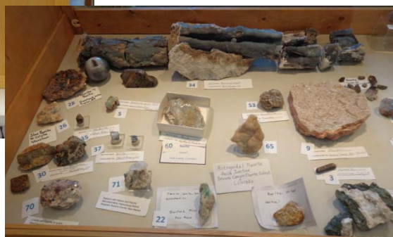
Case #1 specimen entries