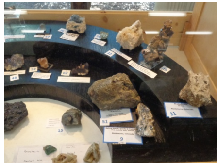
Case #2 specimen entries