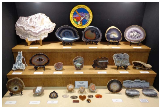
CMS club table case featuring agates