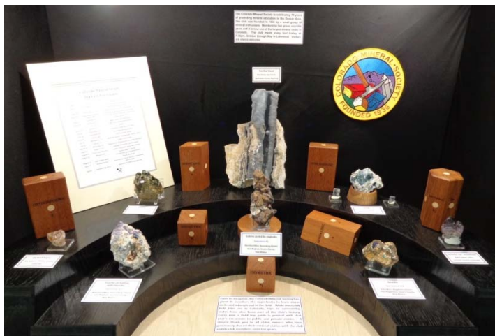
Finalists for the 2014 CMS Prospector Case