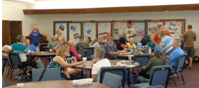
Door prize give-aways