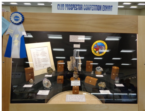
First Place Ribbon - CMS Prospector Case