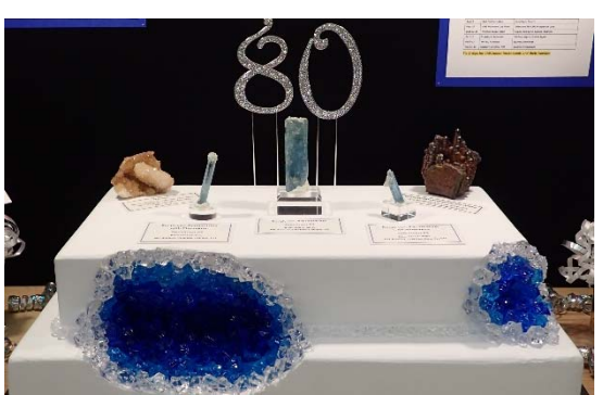
This year's top three aquamarine specimens