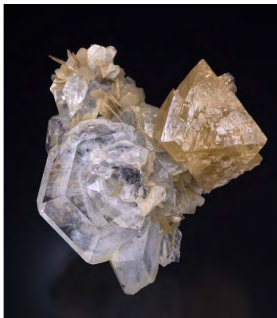
Scheelite with beryl in typical tabular habit. Xuebaoding, 4.2 x 3.7 x 2.2 cm.