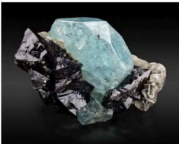
Beryl (var. aquamarine) with cassiterite. Xuebaoding, 21.0 x 13.0 x 10.0 cm. Collection MIM museum.