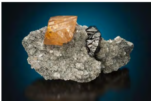
Scheelite with cassiterite on biotite. Xuebaoding, 11.7 cm. Collection Steve Smale.

For a W-Sn-Be greisen the primary minerals are cassiterite, scheelite, and beryl. However, a number of associated rare especially Sn-bearing minerals mushistonite, k sterite, and others.